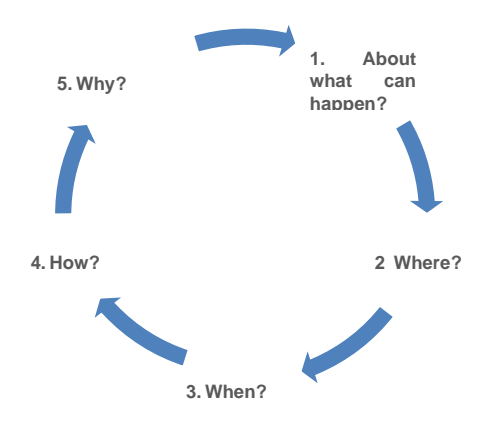
Figure No. 1